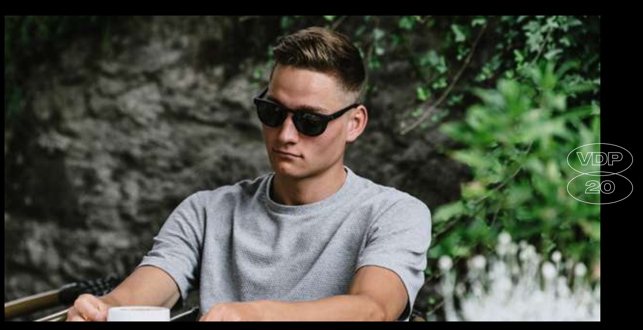
MATHIEU WAN DER POEL