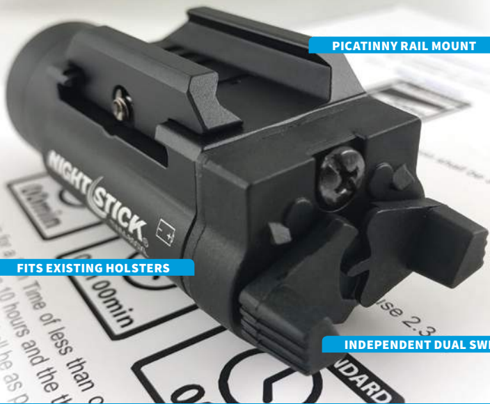
PICATINNY RAIL MOUNT