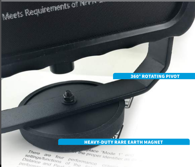
360° ROTATING PIVOT