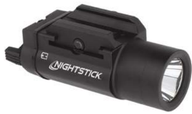
Strobe 350L TWM-350S 850L TWM-850XLS