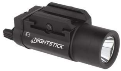
350L TWM-350 850L TWM-850XL