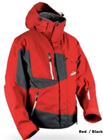
Red / Black