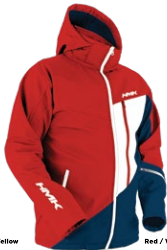
Red / White / Blue