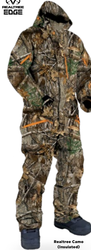
Realtree Camo (Insulated)