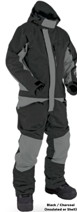
Black / Charcoal (Insulated or Shell)