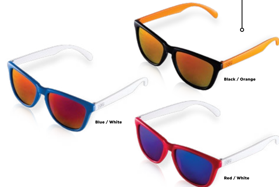
Blue / White