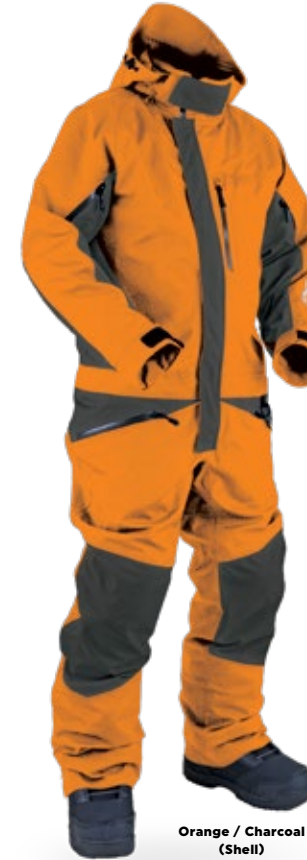
Orange / Charcoal (Shell)