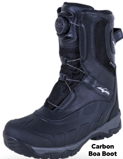
Carbon Boa Boot