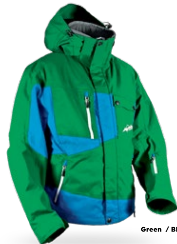
Green / Blue