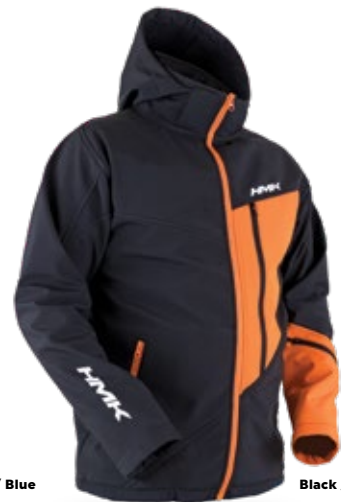
Black / Orange