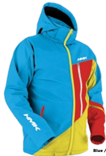
Blue / Red / Yellow