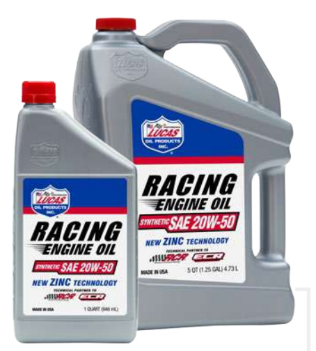
* World's fastest motor oil used in the 2012 Speed Demon run at Bonneville, 462 mph.