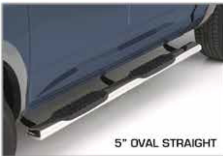
5" OVAL STRAIGHT