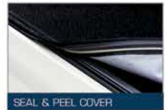
SEAL & PEEL COVER