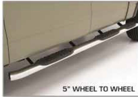
5" WHEEL TO WHEEL