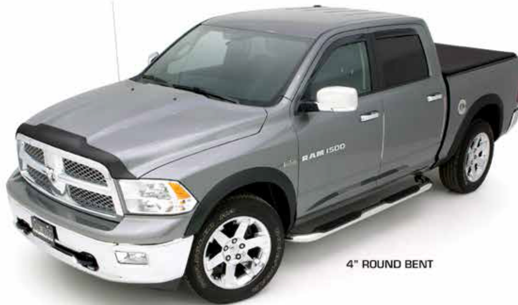
4" ROUND BENT