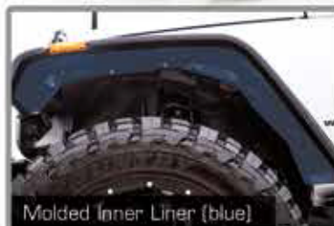
Molded Inner Liner (blue)