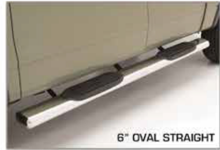
6" OVAL STRAIGHT