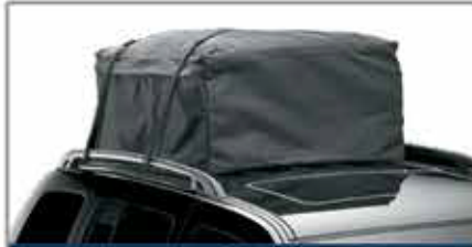
SOFT PACK ROOFTOP BAG