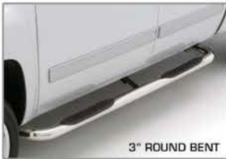
3" ROUND BENT