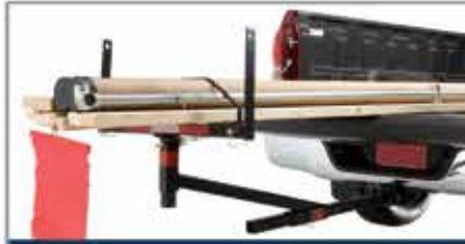
HITCH RACK BED EXTENDER