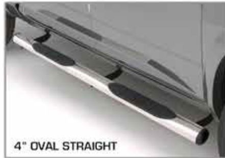
4" OVAL STRAIGHT