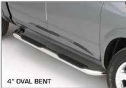
4" OVAL BENT