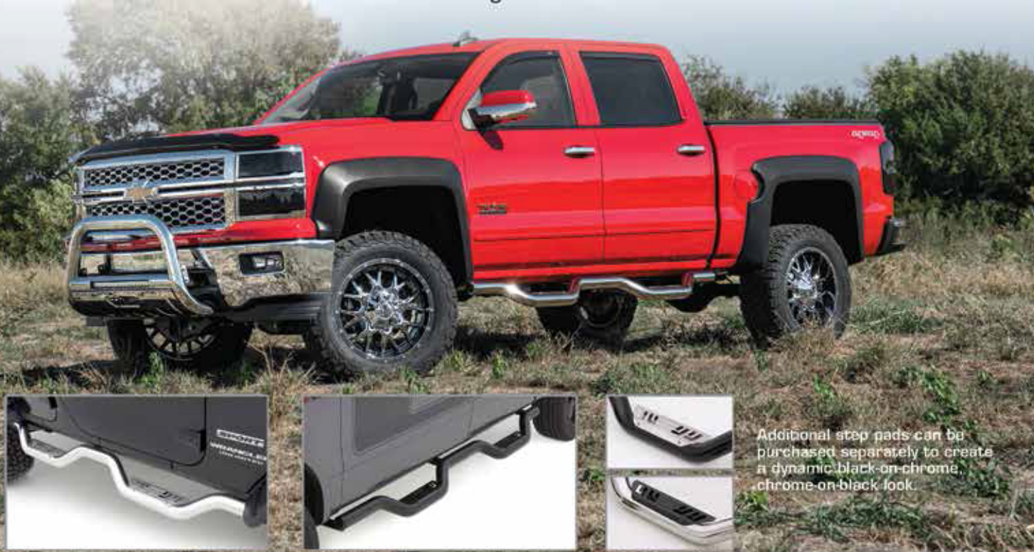
Additional step pads can be purchased separately to create a dynamic black-on-chrome, chrome-on-black look.

The perfectly placed steps dip down and allow occupants to comfortably enter and exit the vehicle with style. Nerf bars come pre-assembled, with all hardware and install easily using our no-drill brackets and customized mounting kits.