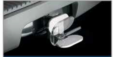
HITCH STEP universal