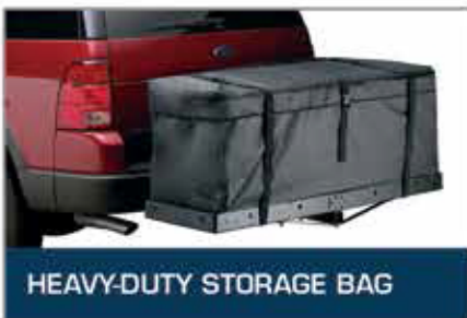
HEAVY-DUTY STORAGE BAG