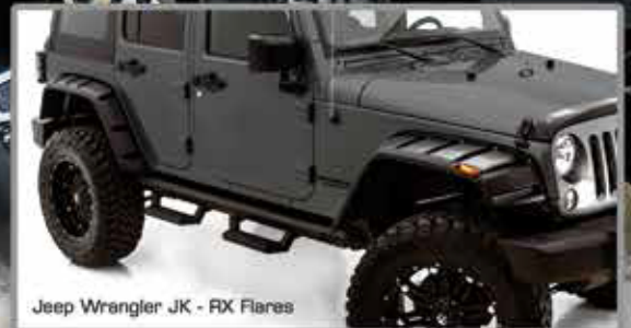
Jeep Wrangler JK - RX Flares