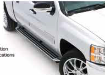
Durable Aluminum construction for Truck & SUV/CUV applications