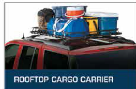
ROOFTOP CARGO CARRIER