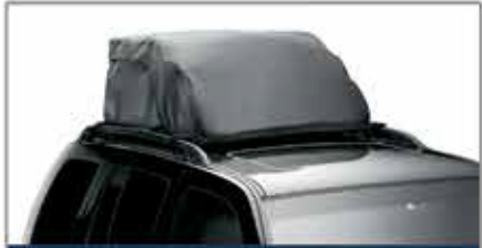
AERO ROOFTOP BAG