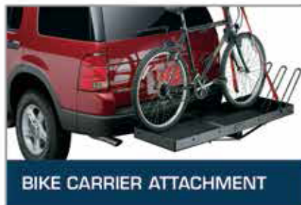
BIKE CARRIER ATTACHMENT