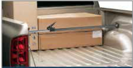
RATCHETING CARGO BAR