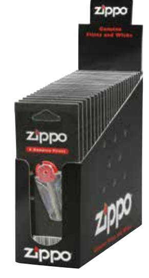
2406N 6 Flints Plastic Dispenser

24 dispensers per display.24 boxes per shipping carton.