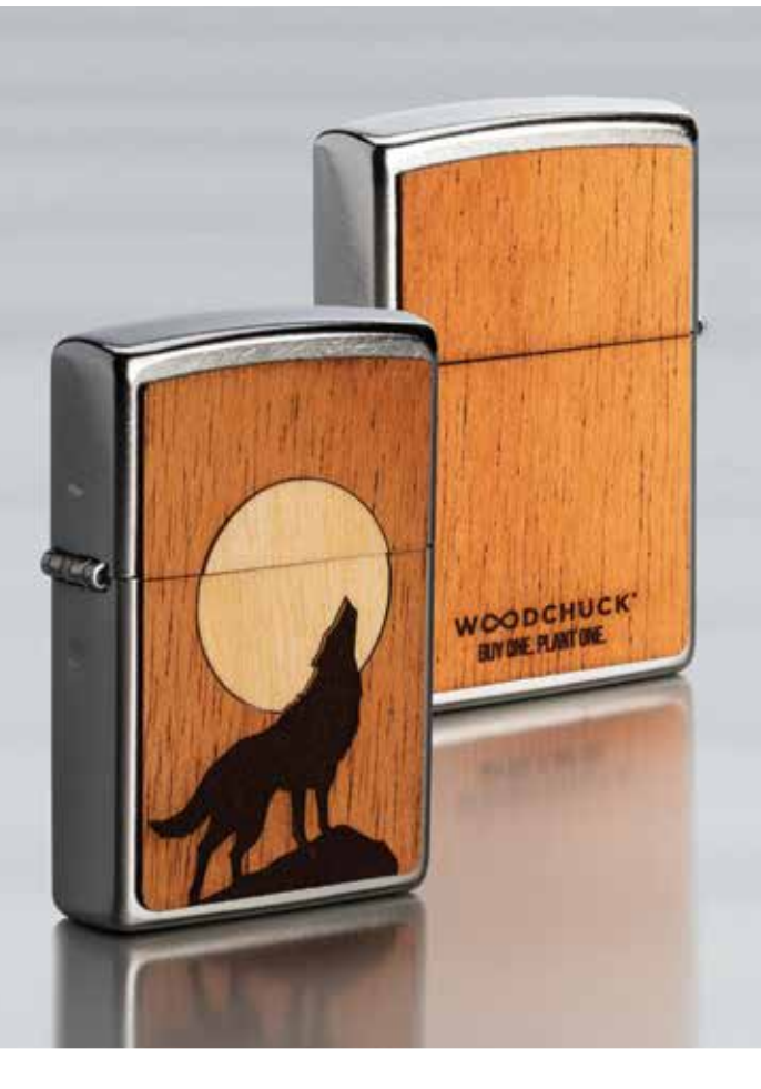
49043 Street Chrome Wood Emblem Attached

Zippo's mission to be a global partner in caring for our planet continues with these two new lighter designs in the WOODCHUCK USA series. These emblem designs incorporate birch and mahogany inlays to create tonal silhouettes. And every single lighter is backed not only by Zippo's famous guarantee, but also a promise to plant a tree for each lighter sold.