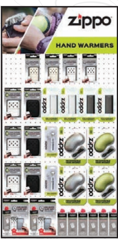
2'w X 4'h