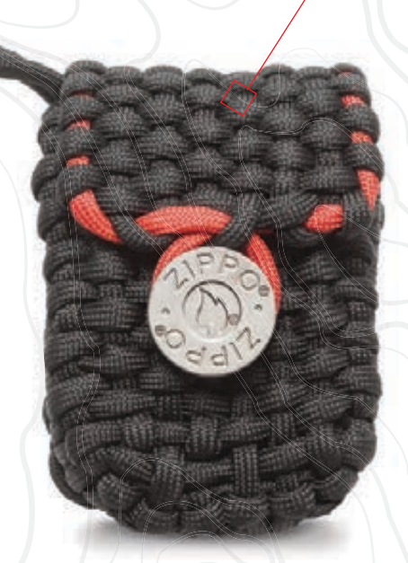
Lighter not included.