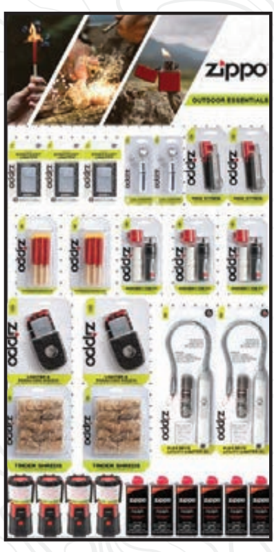
2'w X 4'h