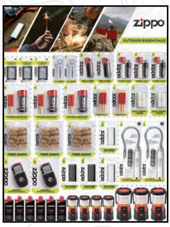
3'w X 4'h