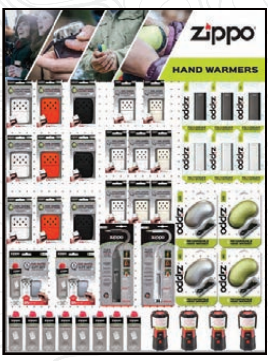
3'w X 4'h